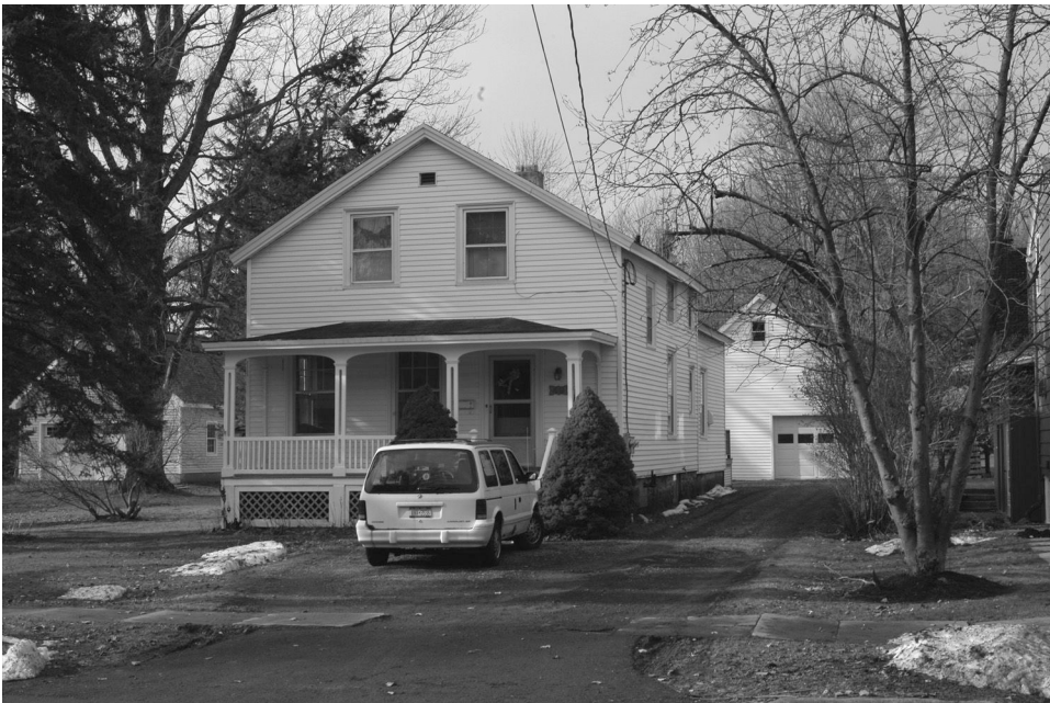
East and north façades